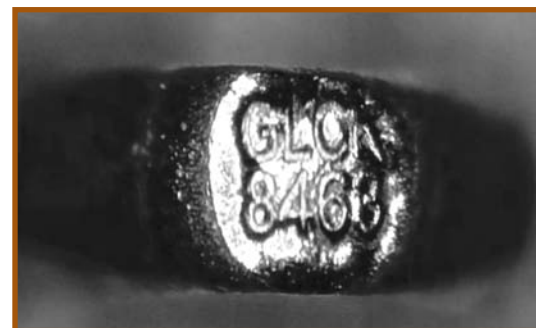
A study by Lucien Haag presented to the National Academy of Sciences featured this Glock firing pin after 1,400 rounds (image reversed).

Finally, the microstamped code is visible using equipment in standard labs. No new or expensive equipment is required to take advantage of microstamping.